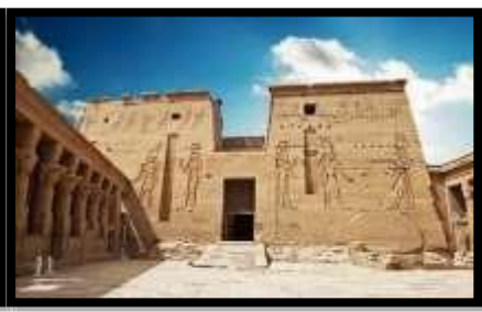
Memorial Nile Cruise "Kings' Valley"